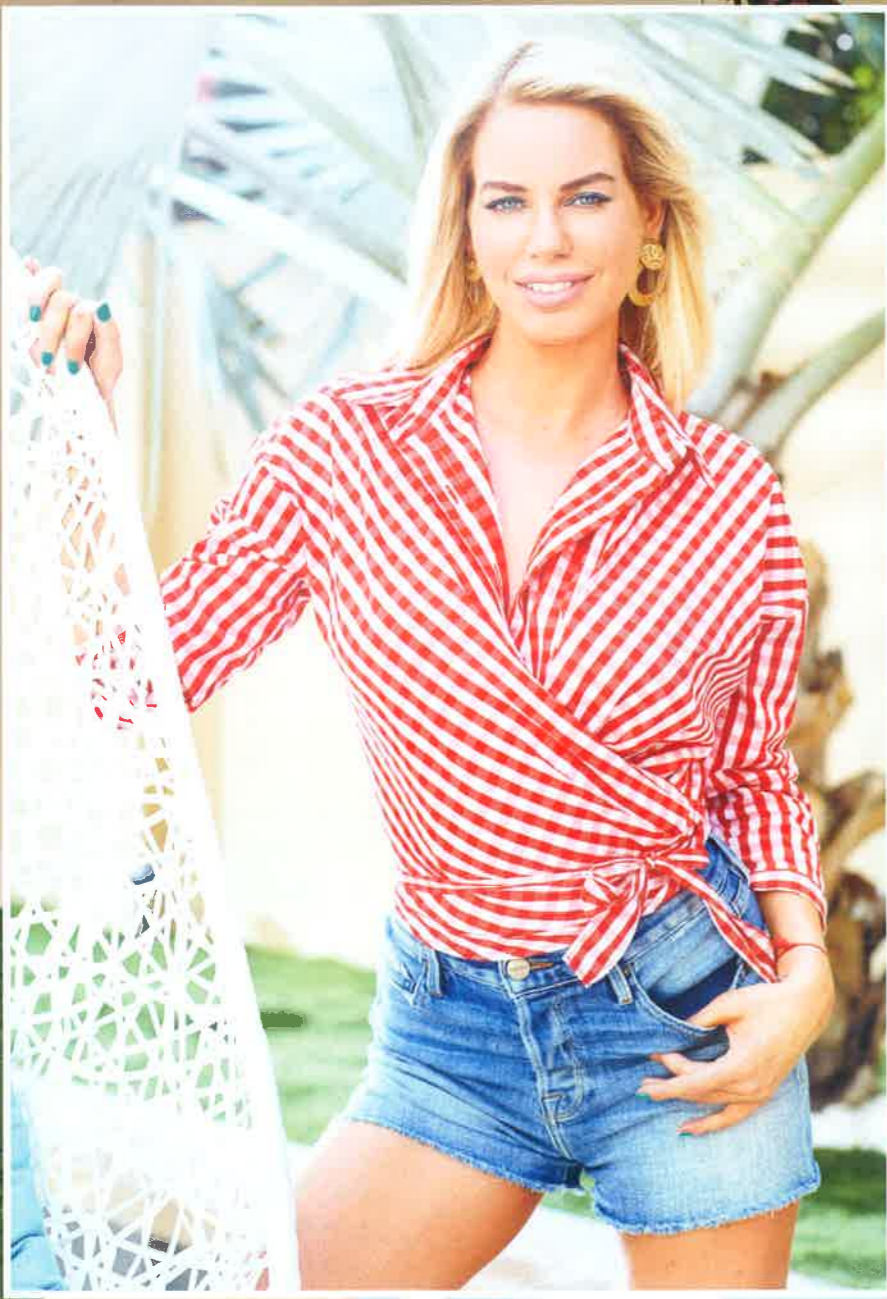
(MAIN PHOTO) CAROLINE'S DRESS, RAG & BONE; AT EL COMING DALL'ES DUEMI; BOOTS, SUNGLASSES, DIOR; (INSET PHOTO) SHIRT, ELISABETH FRANCHI; SHORTS, FRAME DENIM; EARRINGS, CHANEL

'The family is super happy here. What's not to love about this lifestyle?'