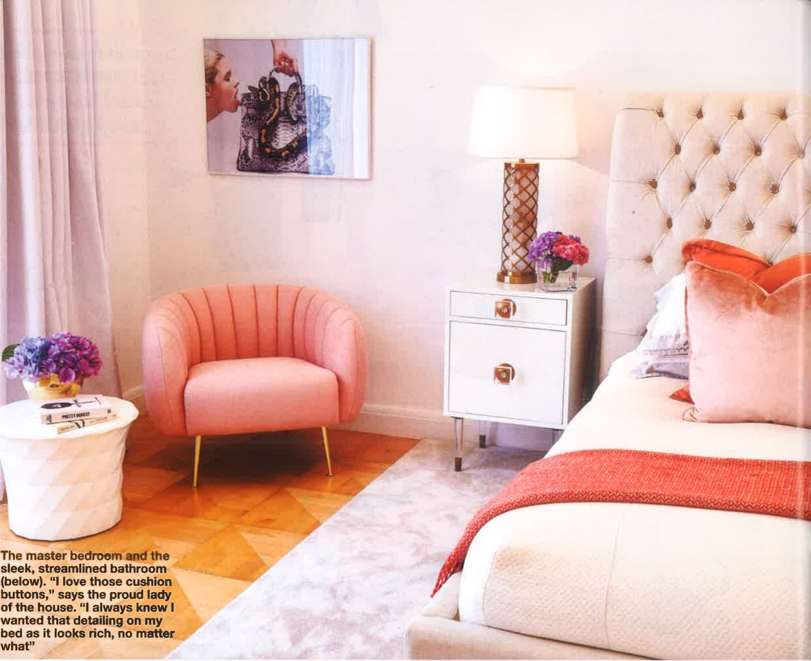
The master bedroom and the sleek, streamlined bathroom (below). "I love those cushion buttons," says the proud lady of the house. "I always knew I wanted that detailing on my bed as it looks rich, no matter what"